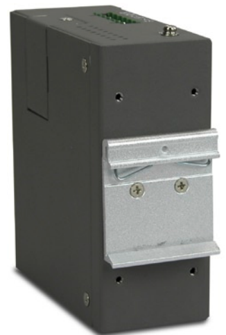
DIN mounting kit for cabinet installation