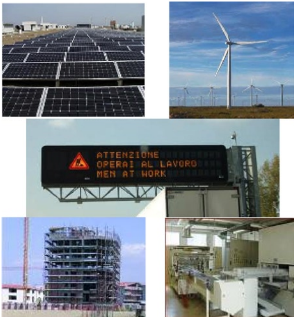
Some fields of applications.